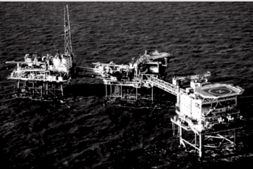
The central processing complex on the Hewett field, in the UK's Southern North Sea.