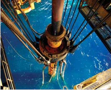
Drilling riser on Eirik Raude rig, offshore Ghana.