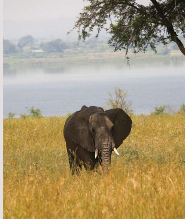
Block 1, Uganda.

The Group achieved a 100% exploration success rate in Ghana and Uganda, which significantly de-risks these major development projects.