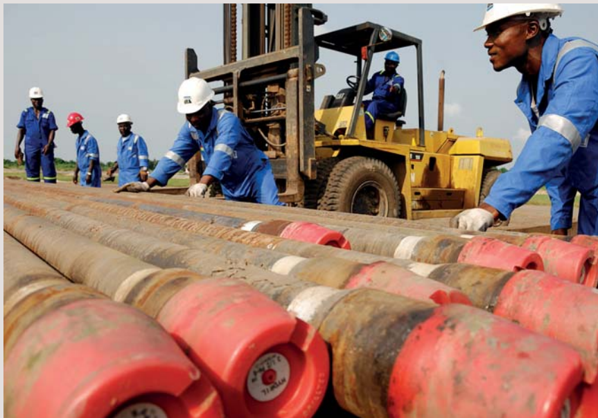
Tullow employees working at the Takoradi pipe-yard in Ghana.

A strong focus throughout the year on health and safety delivered the Group's best ever performance, placing Tullow in the top quartile in the industry.